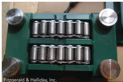
Fitzgerald & Halliday, Inc.