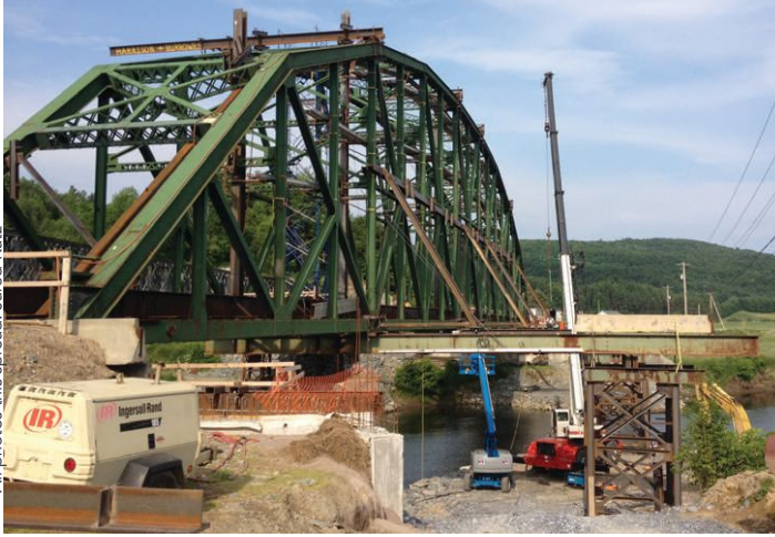
▼ Erecting the new steel. Approximately 120 tons were added.