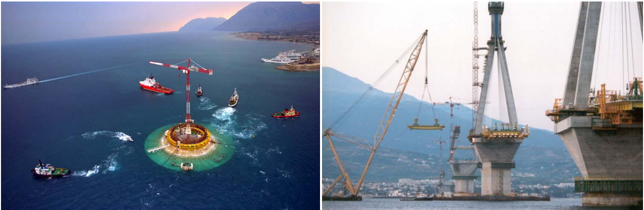
Figure 8: Rion-Antirion Bridge - Towing of a pylon base (left) and erection of the deck (right)

When a pylon base was tall enough to stand a few meters above water, three tugs were taking it to its prepared bed where it was precisely ballasted down. The four bases were placed within a five centimeter tolerance with regards to their theoretical location.