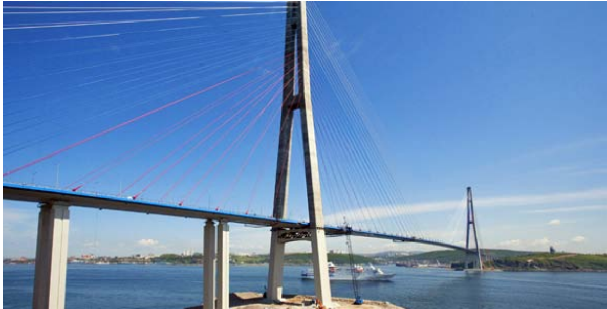
Figure 9: The Russky Island Bridge – World record in the field of cable stayed bridges

Today, cable-stayed bridges are at the origin of a long list of major achievements, with spans ranging from 600 to more than 1,100 meters, most of them being located in China.