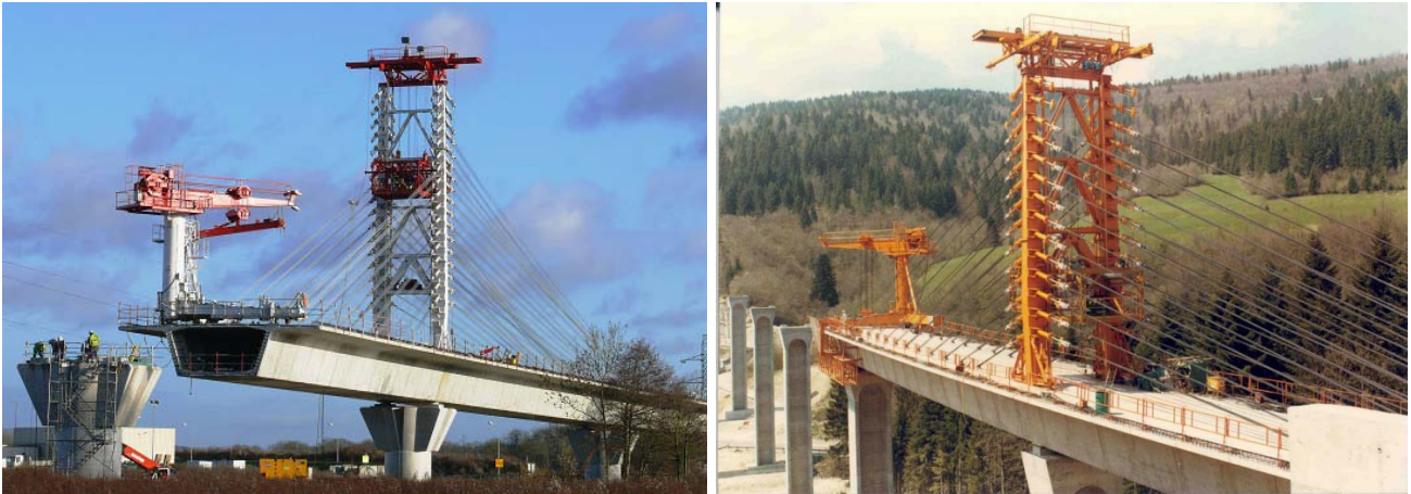
Figure 2: Progressive construction with temporary stay cables

All the construction materials, components and personnel are provided with a high degree of safety at the end of the progressing deck. The stability of the deck during construction, provision and progressive placing of the segments is essentially provided by the temporary stay cable arrangement. As a result, the pre-stressing of a completed span can be done after its completion and the permanent bending moments in the deck are exactly the same as those of the entire bridge cast-in place since match cast segments are used over the total length of the deck; there is therefore no redistribution of bending moments and stresses in the box girder due to creep effects. This means that the tendons just have to run from pier segment to pier segment and, as a consequence, can be easily anchored in the diaphragms ensuring the force transfer to the bearings at deck supports. Pre-stressing tendons encased in a grouted polyethylene duct, can be located outside the concrete, within the void of the box girder, and simply deflected in deviation saddles and the pre-stressing tendon layout of spans built that way is more economical than those used in cantilever construction.