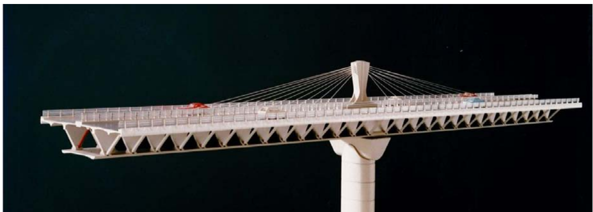
Figure 10: The first extradosed bridge imagined by Jacques Mathivat

It has to be pointed out that, in less than twenty years, the length of the longest span has almost been doubled. The previous record, which was hold since two 2008 by the Sutong bridge across the Yangtze River (China) with a 1,088 meter long main span, has been broken in 2012 by the Russky Island Bridge ( Figure 9 ) crossing the Eastern Bosphorus Strait near Vladivostok (Russia) with a main span 1,104 meters long, a 320 meter high pylon and a longest cable 580 meters in length.