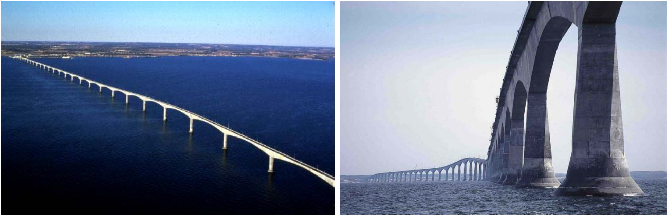
Figure 4: The Confederation Bridge between New Brunswick and Prince Edward Island (Canada)

The 12.9 kilometer long Confederation Bridge ( Figure 4 ), probably the longest bridge in the world across ice-covered water, joins the provinces of New Brunswick and Prince Edward Island in Eastern Canada. At the crossing location, the Northumberland Strait is approximately 13 kilometers wide, with water depth ranging from zero to 30 meters.