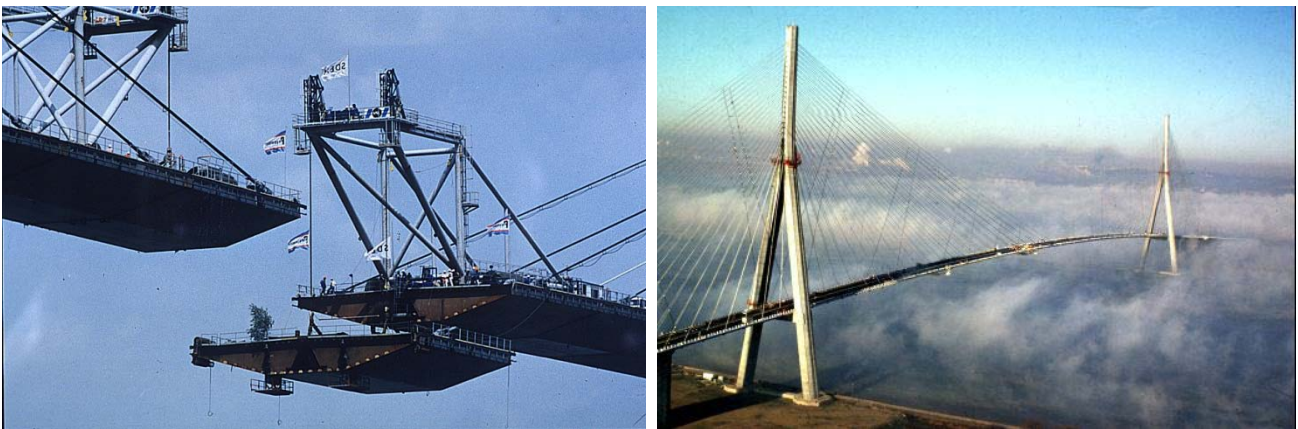
Figure 3: The Normandie Bridge during construction and after completion

Built in a severe environment, the Second Severn Crossing (UK) carries three lanes of traffic plus an emergency lane in each direction. The main component of the crossing is a symmetrical cable-stayed bridge with a central span of 456 meters formed from composite construction with steel longitudinal and transverse girders and a reinforced concrete slab. One of the most significant aspects of the bridge is the way it was built. The 7.30 meter long deck elements were prefabricated full width on a pre-assembly bed before being transported and bolted to the already-built cantilevers. A 2.00-meter-wide strip of the concrete slab was finally cast in place before tensioning of the cables.