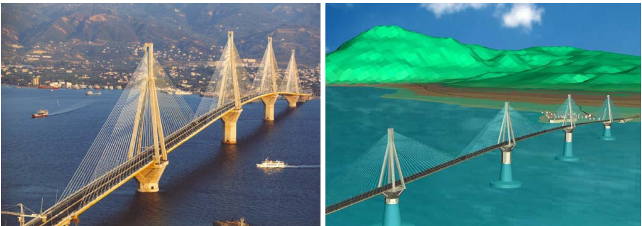
Figure 6: The Rion-Antirion Bridge - The bridge (left) and the concept (right)

The assembly of the whole bridge was finished in November 1996 and it's worth mentioning that, in August 1996 and therefore in one month, two kilometers of the bridge were prefabricated and erected in the Northumberland Strait including foundation preparation and completion.