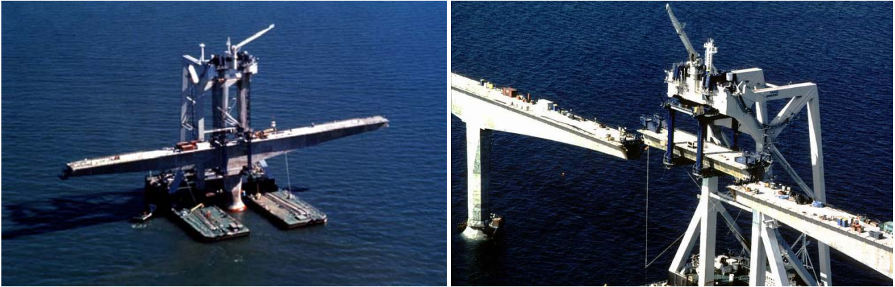
Figure 5: Confederation Bridge - Transportation of a Main Girder and Placing of a Drop-in-Span

The top of the shaft was then prepared to receive the main span. This was achieved by the use of a precast alignment template which had match-cast shear keys fitting exactly into the underside of the main girder. Once the main girder unit was placed, final continuity post-tensioning tendons were installed and stressed, to create a moment-resisting connection between main girder and pier shafts, and mid-span girders were placed, the central span of each frame being made continuous by external PT tendons.