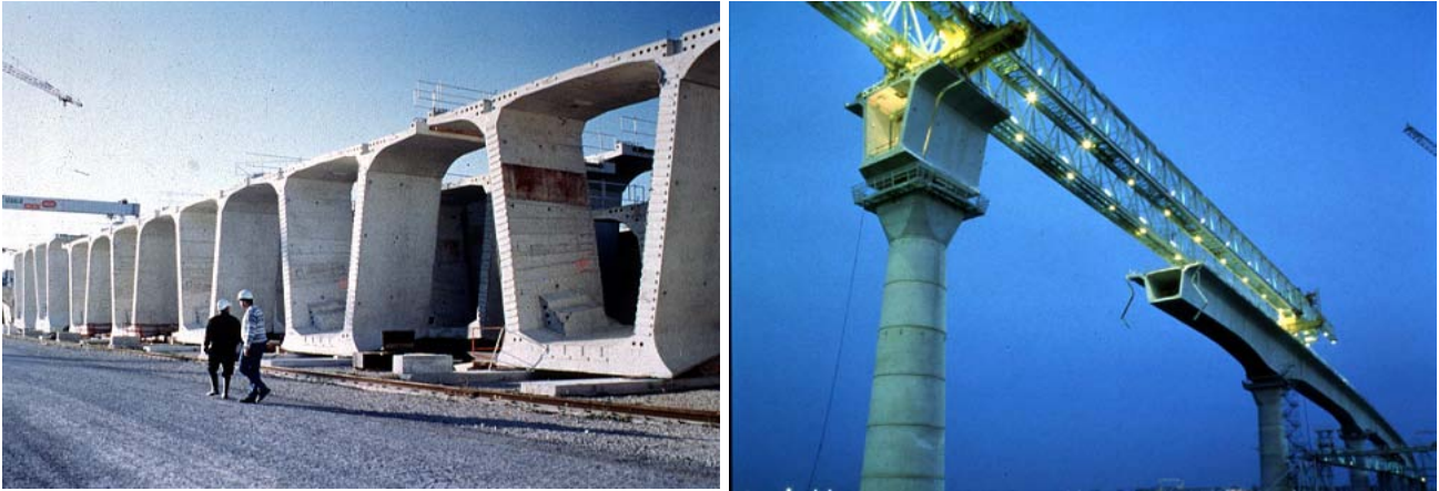
Figure 1: Construction of Avignon Viaducts (French TGV) – Segments and Launching Gantry

The prefabrication installations used can be organized very differently, depending on the available area on the construction site or the type of segments to be produced. When possible, the prefabrication installations consist of a long casting bed, having the appropriate geometry. The other option is to use fixed casting units.